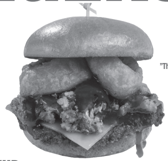
Try "The Big Nasty" Burger!

Fresh cuts of select beef, hand-pressed onto our flat-top grill for that "old-school" crispy-juicy grilled burger "WOW."